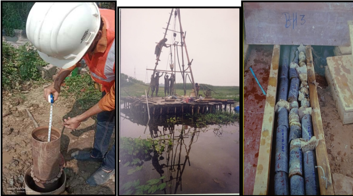
Field Permeability Test near Dum Dum Airport SI work at IOCL Haldia Core Box showing Rock Core Samples Metro Work , AFCONS at DVC Thermal Power Station, Raghunathpur