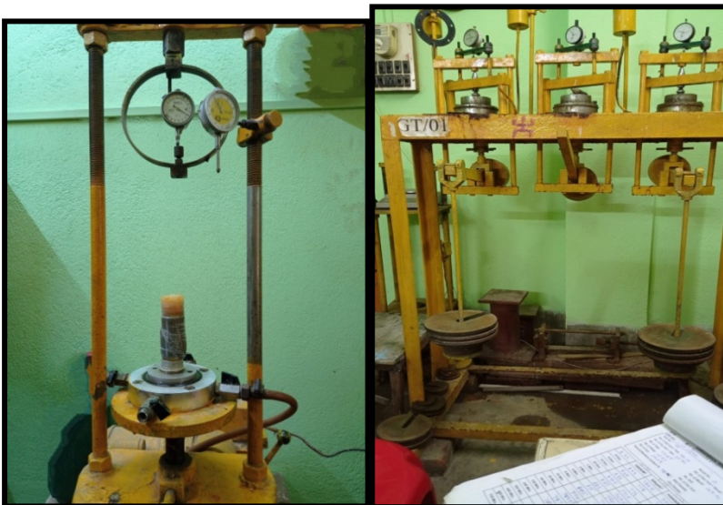
Unconsolidated Undrained Triaxial Test Soil Consolidation Test Apparatus