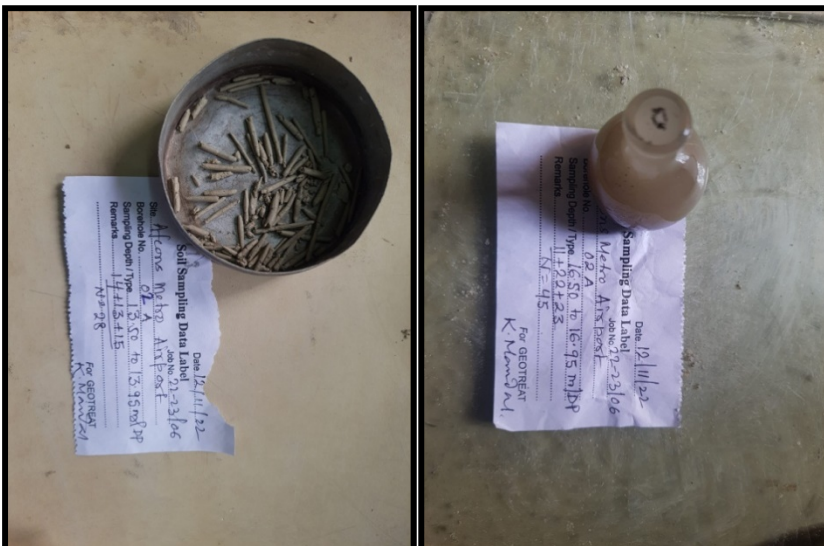
Sample of Plastic Limit Test Specific Gravity Test