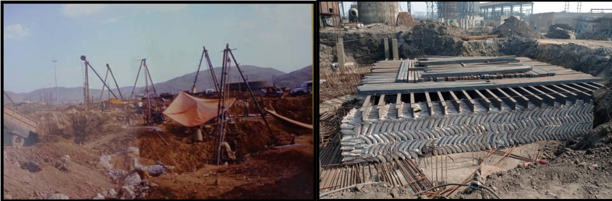
DMC Pilling Work at Paradeep Odisha Pile Load Test at Ranigaunge, Shyam Sel & Power (120 T)