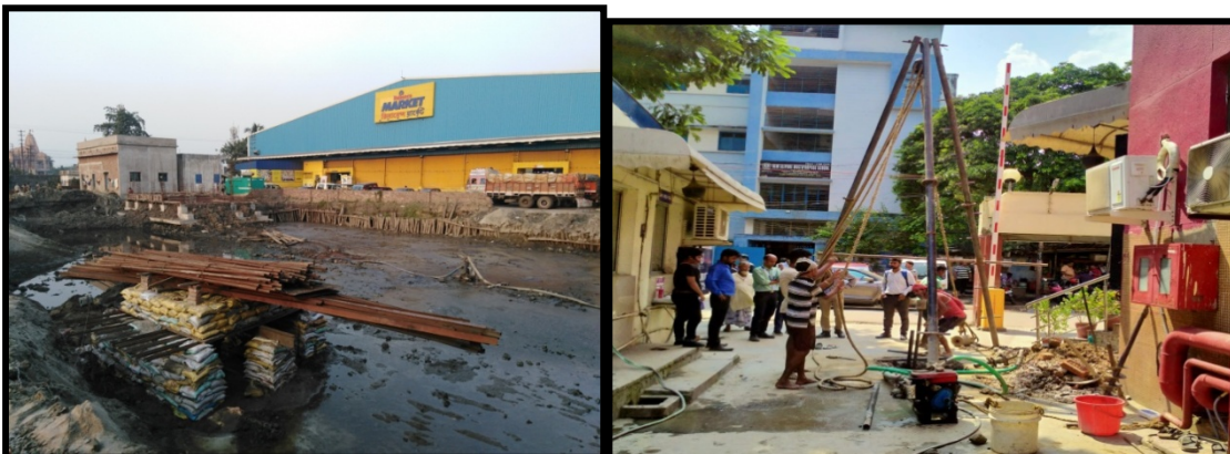
Plate Load Test at Pakuria, Shyam Sel SI Work at B.P. Podder Hospital, Kolkata