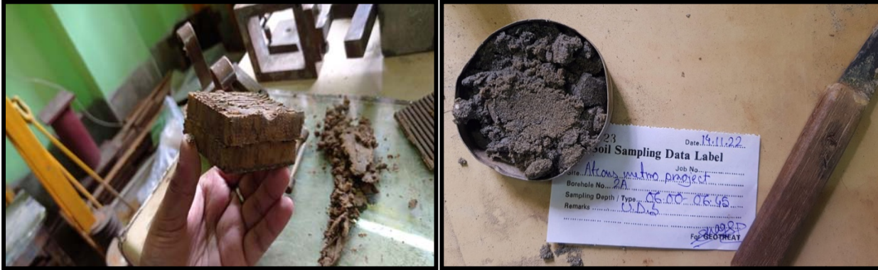
After Direct Shear test of SandSoil Sample taken for Moisture Content Test